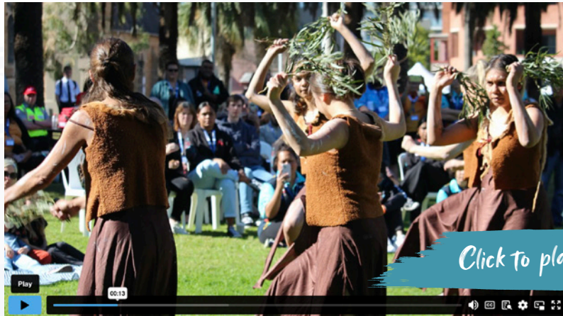
See all the highlights from NATSIEHC23

As a sponsor you can help support exchanges and collaboration that is focussed on increasing accessibility and improving the outcomes of eye health services for Aboriginal and Torres Strait Islander communities to end avoidable vision loss and blindness. Your formal association with the Conference will provide opportunity for national recognition as well as valuable exposure underlying your commitment to support Aboriginal and Torres Strait Islander self-determination and leadership of eye health.