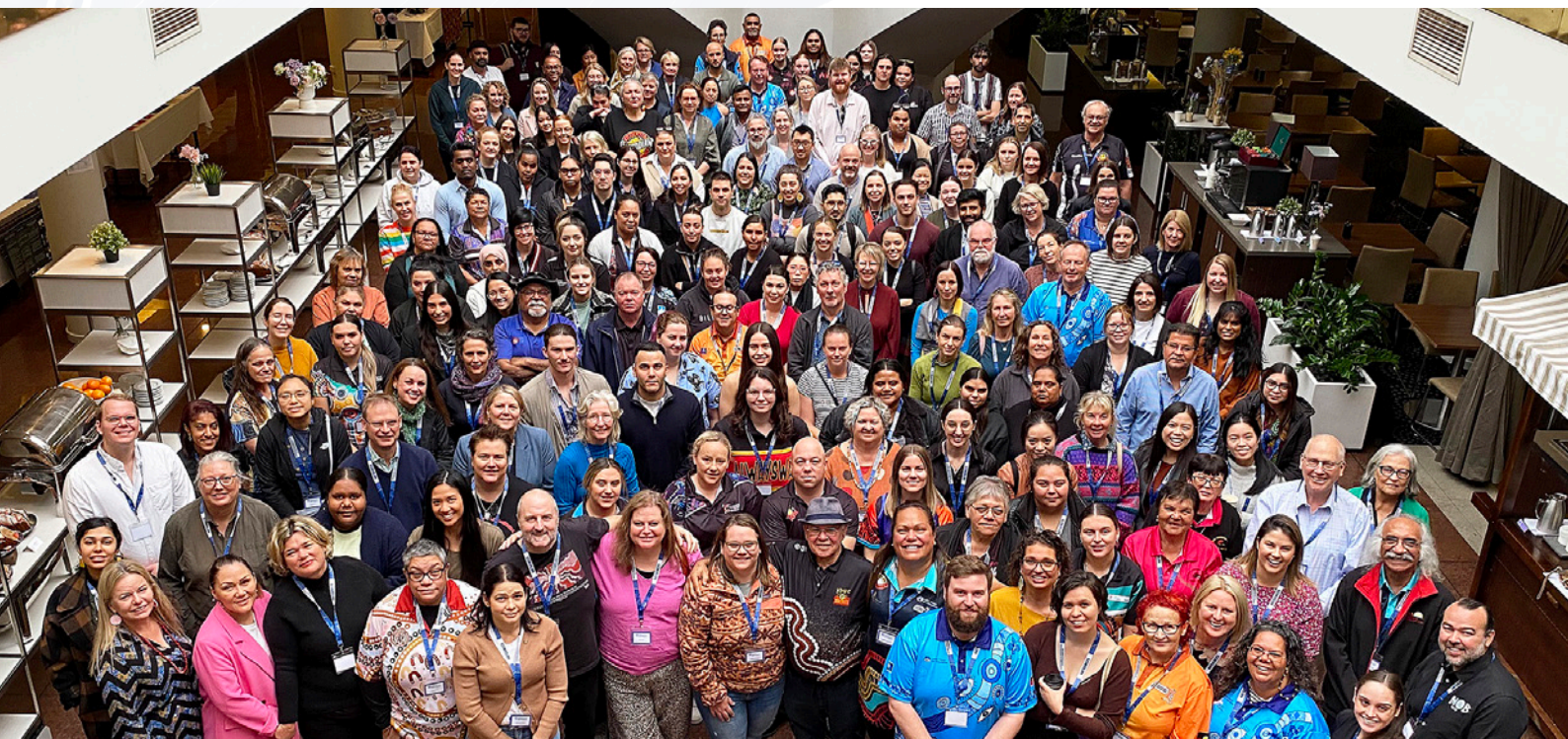
NATSIEHC23 Conference attendees. Dharug Country, NSW, 2023

"Really well organised and facilitated. I'm grateful for everyone who presented, especially those who shared experience that were difficult, sharing those stories helped me better understand the history (that I was never told) and further instil the need for me to not only be an ally, but an accomplice in change".