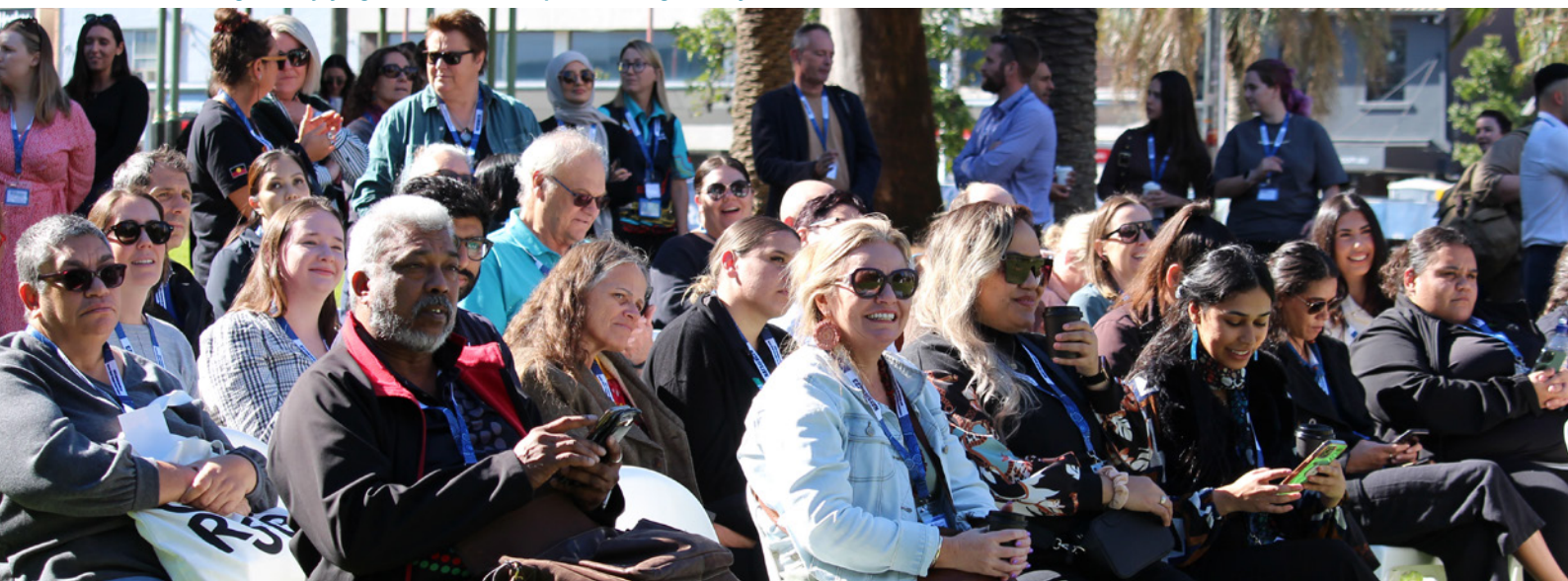
NATSIEHC23 delegates enjoying the Welcome Reception. Dharug Country, NSW, 2023